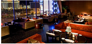
Koy at Planet Hollywood