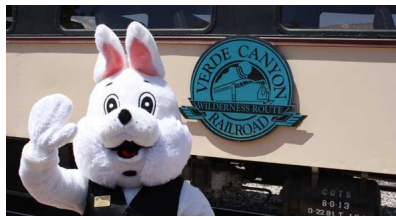
Verde Canyon Railroad Easter Bunny Express

Thursday, 29 March 2018 12:18 - Last Updated Friday, 30 March 2018 15:02