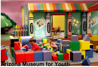
Arizona Museum for Youth

Written by By: Vanja Veric Monday, 16 July 2012 00:00 -