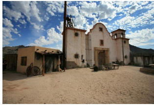
Old Tucson Studios, Tucson

continuously coughing throughout the night and music being played in the haunted cocktail lounge. The Weatherford Hotel has one such guest unwilling to checkout. A young woman floating around the ballroom has been reported many times and continues to keep living guests coming back for another glimpse. www.hotelmontevista.com , www.weatherfordhotel.com/history_stories