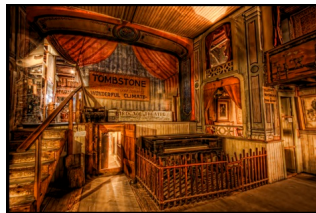
Bird Cage Theatre, Tombstone

Reports of ghosts and hauntings are prominent throughout the town of Bisbee. Some places where spirits are said to still dwell are the Bisbee Bed & Breakfast—where various guests have reported a grandma spirit watching over them during the night and The Copper Queen Hotel, where a young woman wanders the halls, still jilted by her lover. www.unsignedmysteries.com , www.sgha.net/az