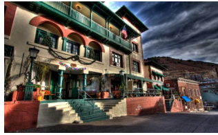
Bisbee Bed & Breakfast and Copper Queen Hotel, Bisbee

Gather your ghouls and prepare for a real haunted experience at these haunted ghost towns around Arizona.