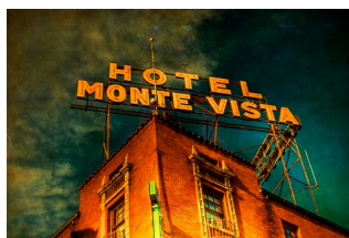
Monte Vista Hotel and Weatherford Hotel, Flagstaff

After the population of Jerome abandoned its buildings in the 50s, stories of ghosts and other spooks ran wild. Today, Jerome is a thriving artist's community, but it's still home to hauntings. The most talked about (and avoided) place rumored to host ghosts is Prostitute Row, an alley that has been reported to have strange shadows that move in the alley, scents of perfume and sounds of footsteps. www.arizonaguide.com