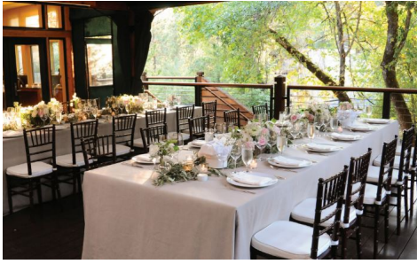
Lakeview Patio (for 2-20 guests)

Wednesday, 15 March 2017 10:09 - Last Updated Wednesday, 15 March 2017 10:22