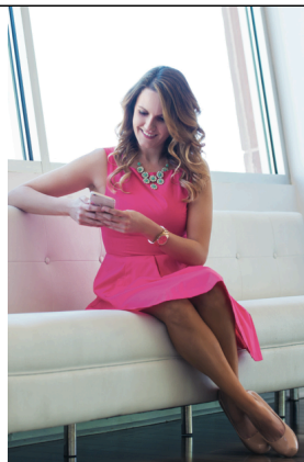
SHOT AT THE CLAYTON ON THE PARK