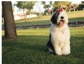
SHOT AT THE CLAYTON ON THE PARK