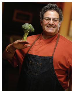
SHOT AT FAIRMONT SCOTTSDALE PRINCESS

horseback riding instructor, says that everything she does is with high energy and passion, traits that she can offer up to a potential mate. “I try to have fun with everything that life throws at me and am a low-maintenance truck-driving tomboy.” As for what this 32-year-old looks for in a significant other: “Ideally, a country boy with a city side and a business mind. And I like my men like I like my horses—tall and handsome.”