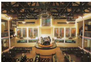
Organ Stop Pizza