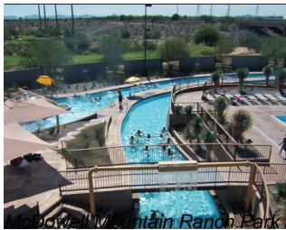
McDowell Mountain Ranch Park and Aquatic Center