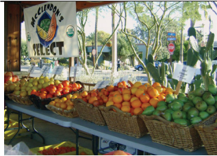
Scottsdale's Old Town Farmer's Market