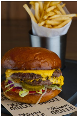
Del Frisco's Grille

a delicious brunch, a must-attend block party and much more—the fun doesn't end until 2 a.m. on Feb. 2. http://wastedgrain.com/