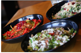
Half Moon Sports Grill

From 3 p.m. to 7 p.m., enjoy $4 featured pints, select wine, specialty cocktails or one of 52 local, craft, import and domestic beers on draft—all while tuning into one of 16 60-inch TV's. Food is dirt cheap and delicious, with prices hovering between $3.95 and $5.95. thirstylongastropub.com/tempe