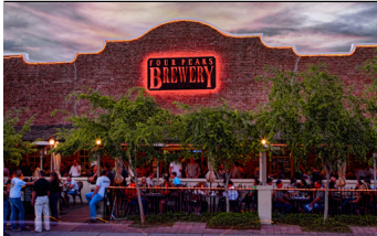
Four Peaks Brewery

On Feb. 1, the Seattle Seahawks and the New England Patriots will face off at University of Phoenix Stadium for the biggest game of the year. If you didn't snag a ticket—and let's get real, who did?—don't sweat it. Any one of these popular spots would love to have you. Check them out this weekend for killer deals and a wild time.