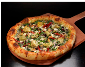
Thirsty Lion Gastropub & Grill

If you're in search of something strong to calm those game-day jitters, head to Camelback Inn's R Bar for over-the-top cocktails. Both the Super Bowl Shandy, made with prickly pear lemonade and Corona, and the Hail Mary Michelada, a spicy blend of tomato juice, Dos XX Lager, lime juice, Worcestershire and hot sauces and Maggi seasoning, finished with a chili salted rim, ought to do the trick. Don't forget about R Bar's Happy Hour bites—the Super Bowl Shandy pairs well with the chicken quesadilla, while the Hail Mary Michelada is the perfect accompaniment to a bowl of fresh tableside guac. http://www.marriott.com/hotel-restaurants