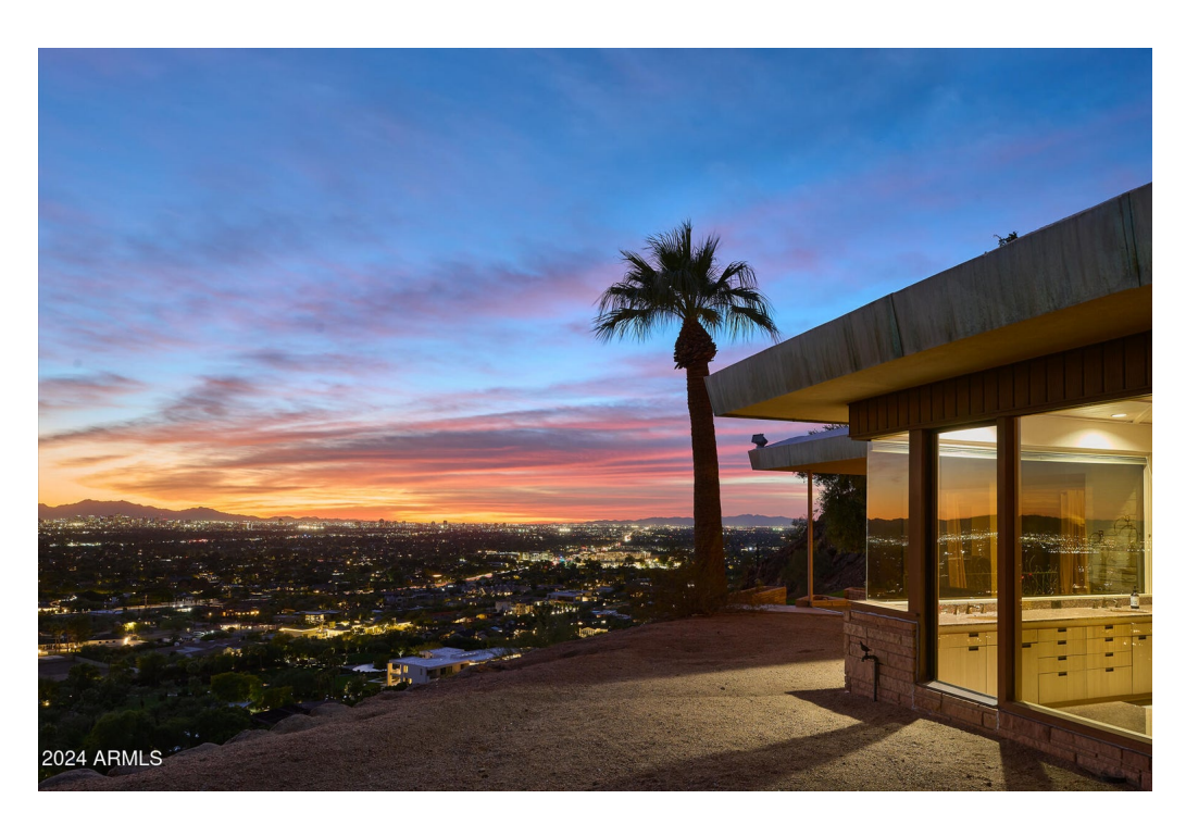
List Price: $30,000,000