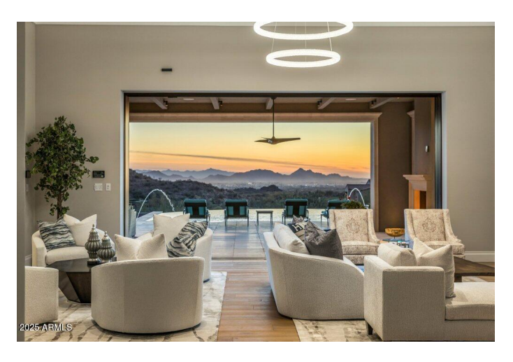
List Price: $25,000,000