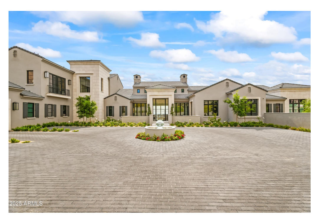
List Price: $25,000,000