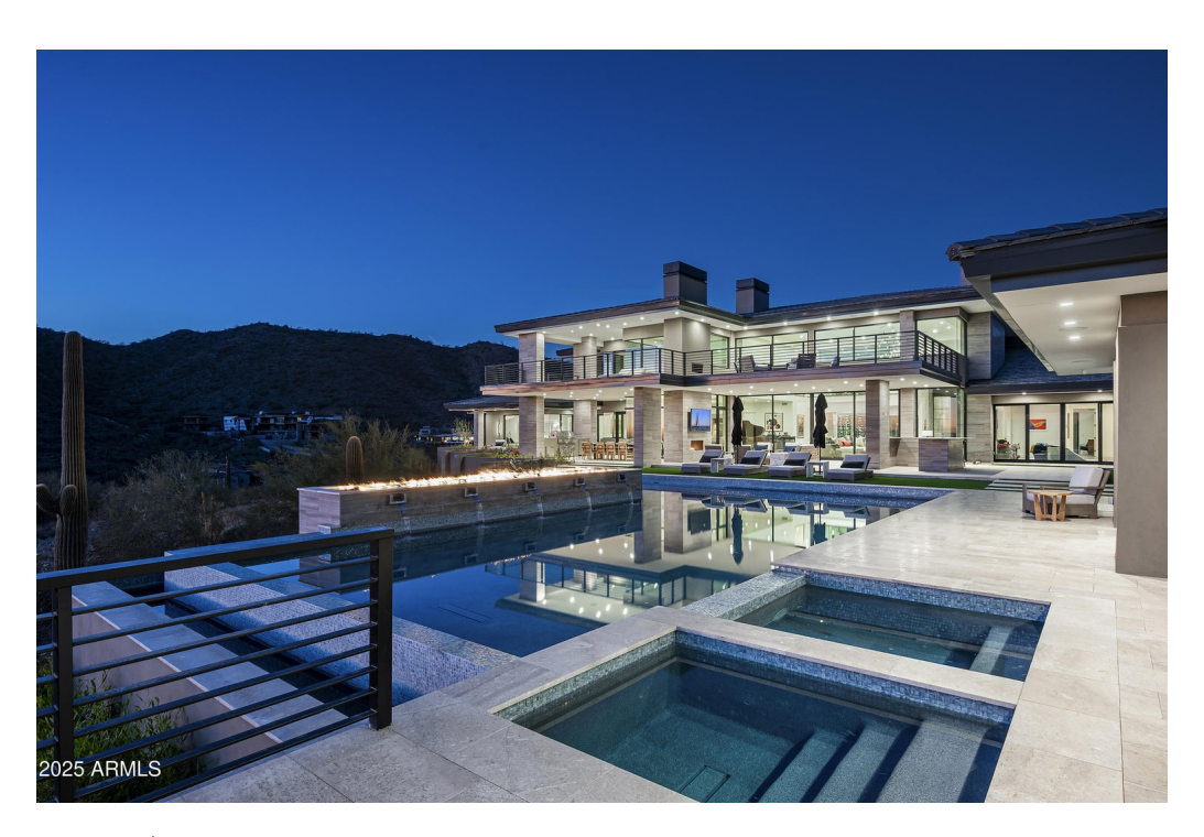
List Price: $29,500,000