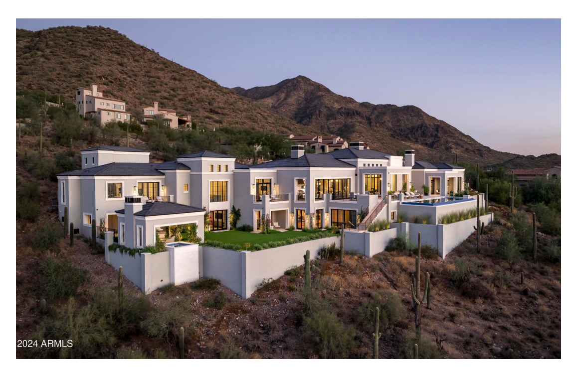
List Price: $29,500,000