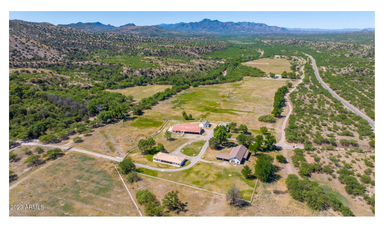
List Price: $29,950,000