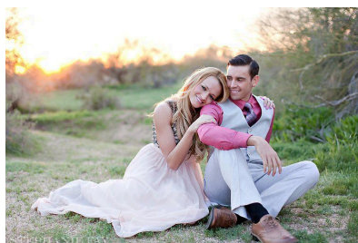
Beautiful engagement session

Your captured moments don't come cheap but worth every penny; photo packages can range in prices, it just depends on what you want. When meeting your prospective photographers ask what their 'shooting fee' is and standard packaging prices to give you a better price point. Make a point to ask what is included in packages, such as engagement pictures or how much coverage is included on the day of the wedding—just a tip, its usually better to pay for extra coverage and have your photographer present for the entire time. Don't want to miss a precious moment!