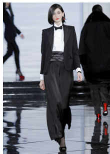
{Design and Picture by Ralph Lauren}

A bowtie on a female is always sexy. I think we have Playboy to thank for that. Menswear for women, tailored and straight lined designs, is a bold design for the bride who wants to make a trend setting fashion statement. Great for an guest arrival reception a few days before the wedding.