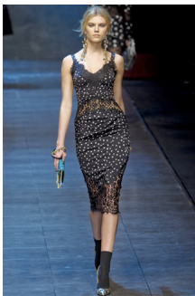
{Dress & Photo by Dolce and Gabbana}

My personal favorite design that incorporated polka dots and lace. How sexy is this design by Dolce and Gabbana. Sexy just might be the new spin on the polka dot pattern.