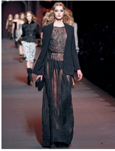
{Design & Photo by Christian Dior}

Friday, 23 September 2011 14:13 - Last Updated Friday, 23 September 2011 14:49