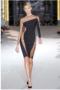
{Dress & Picture by Stella McCartney}

Friday, 23 September 2011 14:13 - Last Updated Friday, 23 September 2011 14:49