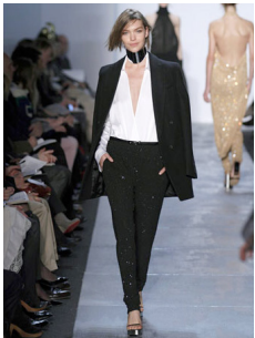
{Design and Picture by Michael Kors}

Michael Kors take on menswear:: a deep-v white tucked in top with tailored pants. Sexy and chic.