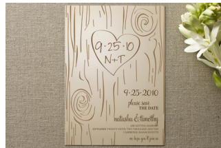
Fall Carving Save-the-Date by Minted

Save-the-dates: Send out at least six months prior to your wedding date. If you have a wedding website, be sure to include that on the save-the-date.