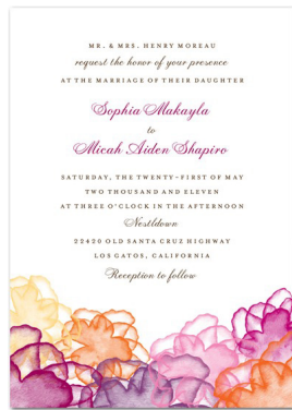
Invitations from Wedding Paper Divas

Invitations: We recommend that you send out your wedding invitations two months before your wedding date. We suggest the couples include an RSVP date that is a month prior to the wedding so that you have time to follow-up with guests that have not responded and to give time to have the escort and place cards designed. Please remember that if you have plated meals options for your guests, you will need to include the food choices on the invite.