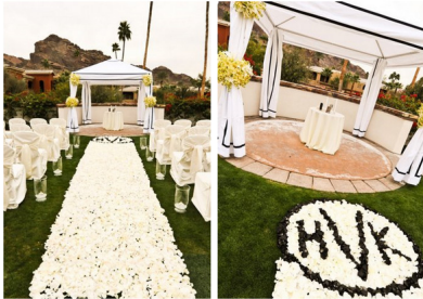
Location: Intercontinental Montelucia Floral: Camelback Flowershop

This canopy was brought in to help fashion an altar. The bride and groom wanted to have both Jewish and Christian traditions mixed in. The carpet of petals down the aisle paired with the couples monogram in rose petals make a perfect spot to become husband and wife.