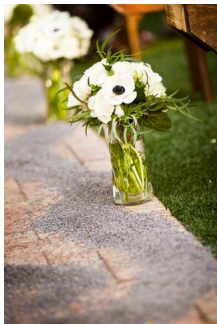
Location: Alegria Garden, Royal Palms Resort Floral: Camelback Flowershop

The backdrop of Camelback Mountain sets the stage for this ceremony. By choosing a location that allows you to use the scenery is what makes getting married in Arizona so special! The aisle here is white flooring which simulates an aisle runner and contributes to the "wow" factor (plus, it makes walking down the aisle in heels much easier versus grass!).