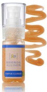
Rhonda Allison Pumpkin Cleanser

Change your daily facial cleanser for the fall with this pumpkin facial cleanser from Rhonda Allison that helps with hydrating dry and damaged skin from the summer.