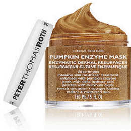
Peter Thomas Roth Pumpkin Enzyme Mask

Pumpkin has a way of warming our hearts in the fall season, but here is a roundup of some of the pumpkin beauty products that have spectacular benefits for your skin to brighten and repair from the harsh summer months behind us.