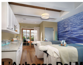
L'Auberge Del Mar

Del Mar may have made its mark on the map for horse racing, but non-equine enthusiasts have something of their own to appreciate here: the elegantly sea-inspired L'Auberge Del Mar. Thanks to a renovation in 2008, L'Auberge manages to feel like both an English country house and a laid-back beach resort. The open-air lobby, garden-level rooms, flowering walking paths and California-cool color scheme all soften the echoes of Tudor architecture. And the spa, which gets everything right, coupled with the resort's acclaimed dining options, means L'Auberge has redefined the Del Mar experience.