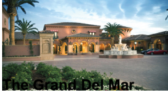
The Grand Del Mar

Tuesday, 29 June 2010 12:02 - Last Updated Wednesday, 30 June 2010 10:15