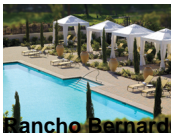
Rancho Bernardo Inn

If you want to experience that sun-drenched, lushly landscaped joie de vivre of the Golden State, the Spanish-style Rancho Bernardo Inn is the place to do it. Its 287 guestrooms all enjoy custom furnishings and balconies, many of which overlook the 18-hole championship golf course that's hosted both PGA and LPGA events. The fountains, foliage and 265 acres give the place an air of seclusion, yet a day trip to the vineyards of Temecula, picturesque Del Mar or San Diego's beaches are all within an easy distance.