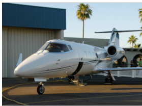
Last year's private jet

The Phoenix Suitcase Party is an awesome concept- patrons congregate for an amazing party (benefiting three incredible non profits) in the luxurious private jet hangar of the Deer Valley Airport- suitcases in tow. Upon entry, guests are handed a raffle ticket- after walking the red carpet and a night of delicious appetizers, drinks, and tunes by the Chadwick's, excitement builds as a luxury jet pulls into the hangar.