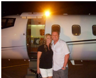
2009's lucky couple

A winning ticket is chosen and the couple drops everything and takes off for an amazing weekend vacation in Sonoma Valley, California. The winner and one friend will enjoy wine tasting, five-star accommodations and a mini-adventure. And- of course- a flight home Sunday evening.