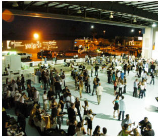
Last year's event

Pack your bags! No, really. You may be taking an awesome vacation this evening.