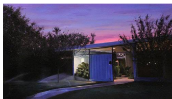
"All of my sins" Oil on Wood Panel by Cam DeCaussin

This exhibition features the artist's current work which is inspired by empty, quiet living spaces and their ability to express themes of solace, sadness, separation and contemplation. This skilled realist painter renders fascinating landscapes, gorgeous interiors, that brilliantly capture contemporary life through quiet intimate moments frozen in time, evoking a sense of voyeurism. Primarily focusing on moments within neighborhood homes during the dawn and dusk hours of the day, these brief moments showcase when life exists within.