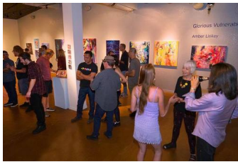
Opening Reception of Glorious Vulnerability hosted by Walter Art Gallery