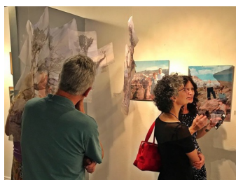
Patrons & Artists Discuss their work and celebrate 1 Year at Royse Contemporary