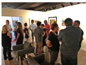
Bustling 1 Year Anniversary Celebration & Artist Reception at Royse Contemporary