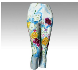
"Happy Memories" Leggings Available at Gallery Andrea

Visit Gallery Andrea and experience their incredible artwork first hand and meet this delightful and dynamic mother-daughter duo! Gallery Andrea showcases diverse variety of artwork and styles, in addition to a small rooster of artists that are local, national and international. The gallery participates in the weekly Thursday Scottsdale ArtWalk from 7pm to 9pm (each week). The gallery is located at 7019 E. Main Street, Scottsdale open daily from 11am to 5pm, closed only on Sunday. For more information about Gallery Andrea visit them online at http://artandrea.com/ . * All images are courtesy and copyright of Gallery Andrea.