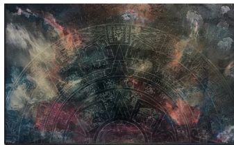
"Predications", Mixed Media Framed in Steel, 41 x 26", 2018 By Angel Cabrales

Monday, 23 April 2018 09:36 - Last Updated Monday, 23 April 2018 10:50