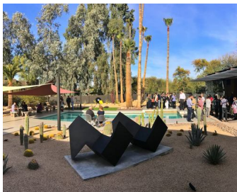
Tieken Studio & Gallery, Paradise Valley