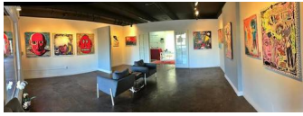
"The Tieken Zone- No Rules Apply!" at Royse Contemporary

to being featured in numerous publications both online and in print in such publications at Phoenix Magazine, Artillery Magazine and Juxtaposed Magazine.