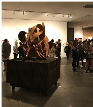
Pete Deise Sculpture Surrounded by Chaos Theory 18 Crowd!

Wednesday, 18 October 2017 17:16 - Last Updated Wednesday, 18 October 2017 17:17