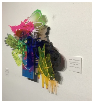
Daniel Funkhouser Mixed-Media "ADHD Materials Study: Vyvanse 20mg"

Wednesday, 18 October 2017 17:16 - Last Updated Wednesday, 18 October 2017 17:17