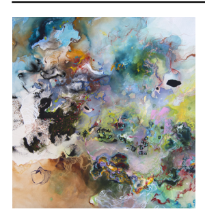
"Thicket" by Charmagne Coe

Written by Nicole Royse Thursday, 07 September 2017 08:46 - Last Updated Thursday, 07 September 2017 08:55