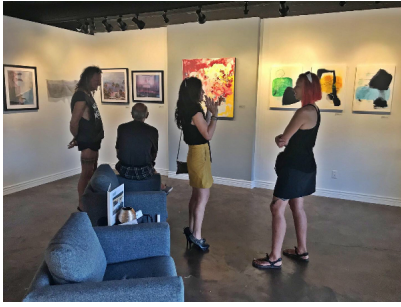
Gallery view of "Moments of Color" Exhibition at Royse Contemporary

Wednesday, 17 July 2019 11:10 - Last Updated Wednesday, 17 July 2019 12:10