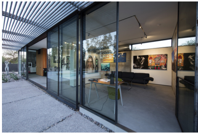
Exterior of the Tieken Gallery

Tieken Gallery will host an Invitation Only Opening Reception on Saturday, April 27th. The show will open to the public on Sunday, April 28th from 2:00pm-5:00pm. In addition to the show, guests will experience a light-filled botanical garden complemented with sculptures and a working artist studio. Private and group showings are available by appointment during the run of the exhibition.