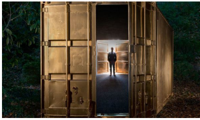
Portal by Shared Studios

Tuesday, 19 March 2019 10:23 - Last Updated Tuesday, 19 March 2019 11:37