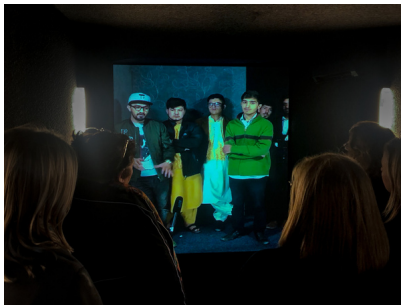
Connect with people around the world through the Portal

To visit the Portal is FREE and you may walk up or schedule a specific time to connect with other Portal users from around the world at a specific date and time ( register here ). The Downtown Tempe Portal is located in the heart of Downtown Tempe at Centerpoint Plaza , 660 S. Mill Ave, Tempe, AZ 85281. Featuring daily hours Monday through Thursday from 11:00am to 2:00pm, Friday from 11:00am-2:00pm & 5:00-10:00pm and Saturday/Sunday 12:00 to 5:00pm.