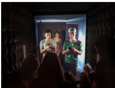
Inside the Portal

Head to Downtown Tempe to experience the Portal, a dazzling gold shipping container boasting an exciting immersive, interactive audiovisual experience connecting to a network of sites around the world. Don't miss this incredible project linking communities around the world, allowing us to engage and connect with one another on a new level.