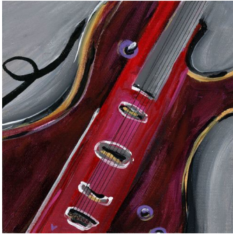
"Rock On" By Lori Mole

Thursday, 14 March 2019 10:41 - Last Updated Thursday, 14 March 2019 10:46