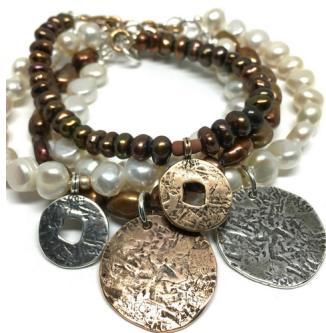
Jewelry by Rosa Kilgore Jewelry