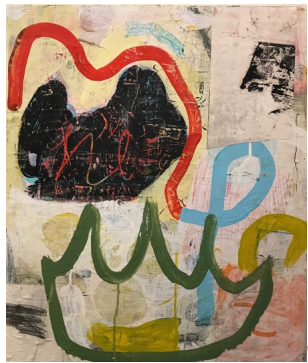
"Lucky You" By Tom Ortega

Monday, 28 January 2019 20:23 - Last Updated Monday, 28 January 2019 20:27