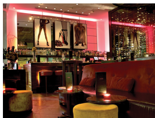
Christopher's Restaurant & Crush Lounge pictured above

From steak to sushi and everything in between, we present your faves in Food & Wine in the Valley.