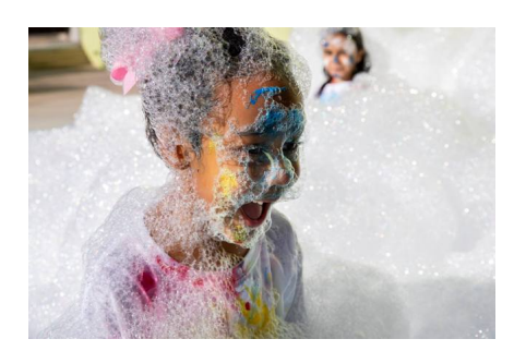
Make-A-Mega-Mess with FOAM at Children's Museum of Phoenix

Arizona Science Center inspires and delights creators, climbers and space-lovers of all ages with its limited-time <u>Cosmic Playground</u> experience through Jan. 13. Guests can climb, slide and explore the galaxy in a unique all-ages play space made almost entirely of household packing tape, and participate in an array of space-themed activities while immersed in cosmic light, sound and motion. Cosmic Playground is a shoe-free environment. Guests must wear clean socks or purchase a pair at the center for $1 (while supplies last). The experience is ADA accessible.