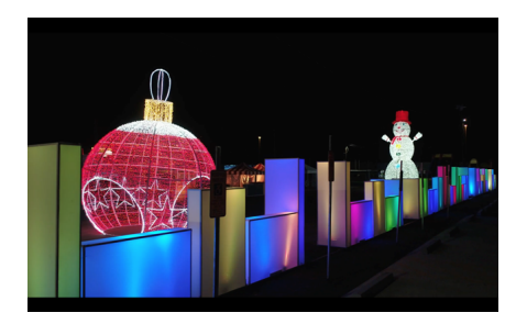
Illumination: Symphony of Light

Illumination: Symphony of Light will debut in Tempe this year. The 25-minute spectacular drive-through attraction will showcase unforgettable holiday icons and a 500-ft. tunnel deemed "Santa's Portal." The stunning portal will display vibrant lighting effects that will swirl around cars in sync with catchy holiday favorites piped in through cars FM dials. Plus, North Phoenix's location, where the 2017 Illumination kicked off in 2017, will introduce a new 100-ft.-wide nativity scene, along with an expanded Holiday Boulevard Marketplace. Purchase tickets <a href="here">here</a>.