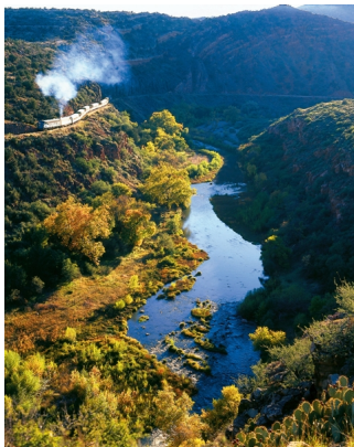
Verde Canyon Railroad.

Have teens looking for a fright? Guests enter Base Camp Ray at Schnepf Farms and are intensely immersed in the training against the zombie infestation. A team of soldiers will create an unforgettable experience for new recruits while they board war rigs and embark on top-level missions across unknown zombie wasteland to help save Schnepf Farms and the human race. Each recruit will be issued a Tippmann 98 custom paintball gun to suppress the onslaught of zombies. Tickets are $22; The Outbreak at Schnepf Farms takes place every Thursday through Sunday, from Oct. 4 to Oct. 28 from 7 to 10 p.m., and Friday and Saturday from 7 to 11 p.m.