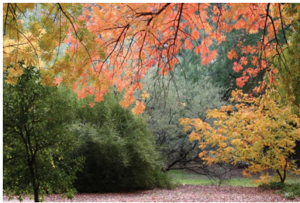
Boyce Thompson Arboretum

Tuesday, 04 September 2018 10:46 - Last Updated Tuesday, 04 September 2018 11:00