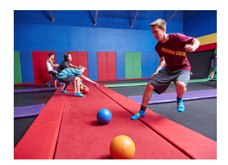
Teddy Bear Tea Time

Children ages 6 and under are invited to bring their favorite teddy bear to jump and play with at AZ Air Time trampoline park from 10 a.m. to noon. Complimentary iced tea, lemonade and cookies will be served to the children. Coffee will also be served to the parents. Special admission pricing is $6 per hour per child. Foam pit and rock wall climbing is included with admission. Jump socks are required.