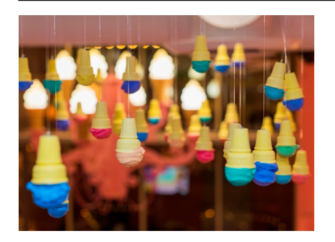
The Art of Ice Cream Experience Bike Crawl

Written by Editorial Monday, 16 April 2018 09:43 - Last Updated Monday, 16 April 2018 13:25