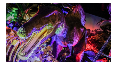
Dino Day at Pangaea Land of the Dinosaurs

Monday, 16 April 2018 09:43 - Last Updated Monday, 16 April 2018 13:25