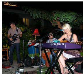
(Dearspeak Plays Phoenix Fashion Week)