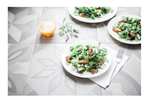
Best Healthy Dining in Phoenix

From Jan. 10 to March 22, a parcel of land in North Scottsdale will transform into a vibrant arts community for 10 weeks during Arizona Fine Art EXPO. Under white tents on the southwest corner of Scottsdale and Jomax Roads, the event features 124 patron-friendly artist studios that allow a glimpse at the artists, who hail from around the globe, at work—from sculpting to painting to carving and beyond. Season passes are $10; children under 12 are free. Parking is free.