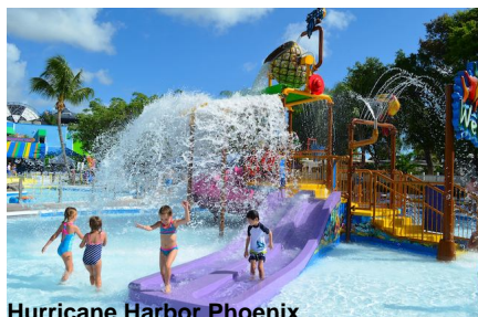
Hurricane Harbor Phoenix

p.m. Tickets to the movie are currently on sale at the theater box office and online.