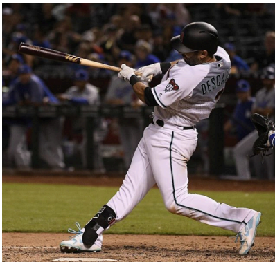
Arizona Diamondbacks vs. Houston Astros at Chase Field

Buy yourself some peanuts and Cracker Jacks and take yourself out to the ball game this weekend to support our Arizona Diamondbacks as they go head to head with the Houston Astros. This three game series starts on Friday, May 4, at 6:40 p.m., continues Saturday, May 5, at 5:10 p.m., and concludes on Sunday, May 6, at 1:10 p.m. To purchase tickets, click here .