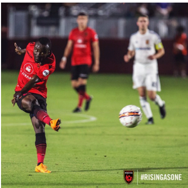
Phoenix Rising vs. LA Galaxy at Phoenix Rising FC Soccer Complex

Buy yourself some peanuts and Cracker Jacks and take yourself out to the ball game this weekend to support our Arizona Diamondbacks as they go head to head with the Houston Astros. This three game series starts on Friday, May 4, at 6:40 p.m., continues Saturday, May 5, at 5:10 p.m., and concludes on Sunday, May 6, at 1:10 p.m. To purchase tickets, click here .