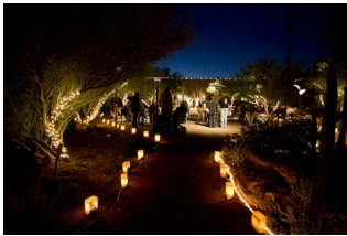
Las Noches de las Luminarias

Information: The site is located at: 1201 North Galvin Parkway, Phoenix. Now through Dec. 30. 5:30 to 9:30 p.m. www.dbg.org .