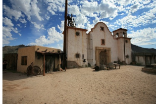
Old Tucson Studios, Tucson

continuously coughing throughout the night and music being played in the haunted cocktail lounge. The Weatherford Hotel has one such guest unwilling to checkout. A young woman floating around the ballroom has been reported many times and continues to keep living guests coming back for another glimpse. www.hotelmontevista.com , www.weatherfordhotel.com/history_stories