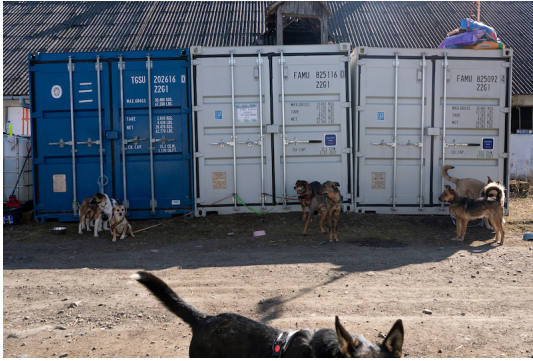
Photo: Dogs wait to be walked while their cages are cleaned at the Fundacja Centaurus aid camp in Medyka, Poland. These dogs are from different parts of Ukraine, all rescued and brought out of the country by volunteers. March, 2022.

Tuesday, 07 February 2023 10:56 - Last Updated Friday, 24 February 2023 17:09