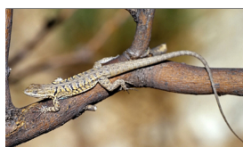
Arizona-Sonora Desert Museum

With exhibits that explore the ocean, dinosaurs, the rainforest, Mars and much more, children and their families are in for both education and entertainment when exploring the Tucson Children's Museum. Whether visiting for a birthday party, one of the museum's special events (think events like World Art Day and Tykes Time) or just a day out with the little ones, the Tucson Children's Museum promises a fun time for kids young and old. www.tucsonchildrensmuseum.org .