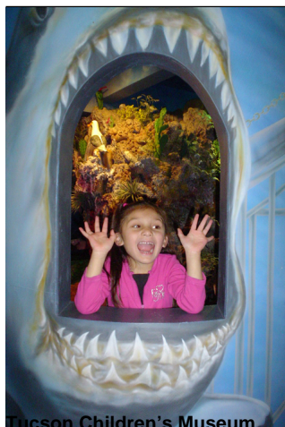
Tucson Children's Museum

With the kids officially out of school for the next couple of heat-drenched months, you'll need more than just the park and swimming pool circuit to keep the little ones entertained and the play dates painless. The following Tucson attractions are fun and educational ways to get your tykes out of the house for a few hours. Plus, you may even learn a thing or two.