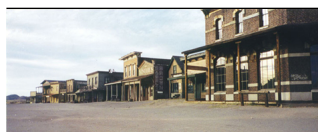
Old Tucson Studios

In exploring the Arizona-Sonora Desert Museum, children may just find a newfound appreciation for the place in which they live. The Desert Museum is a zoo, botanical garden and natural history museum—all in one place! This wildlife-lovers paradise also offers extensive children's activities such as a junior docent program, Sonoran studies, school and youth programs, the Coati Kids Club and more. www.desertmuseum.org .