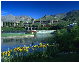
Kids and Family

With nearly 400 spacious rooms for rent, Loews Ventana Canyon capitalizes on Tucson's unique beauty with a fusion of rustic surroundings and modern design. Boasting an array of restaurants, green golf courses and an indulgent spa, the Loews experience will not be one soon forgotten. 520.299.2020 , www.loewshotels.com .