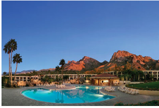
Best Luxury Resort