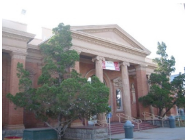
Best Place to be Outdoors

Offering guided tours, birthday parties and a non-stop flow of events, the Tucson Children's Museum will brighten your child's day. The museum has tons of exhibits which cater to every possible interest of your child, all the while having a blast. You could stop by dinosaur world to visit the life-sized robotic dinos; take a trip to the art studio and create a masterpiece; or go to the ocean discovery center to learn about mysteries of the deep. 520.792.9985 , www.tucsonchildrensmuseum.org .