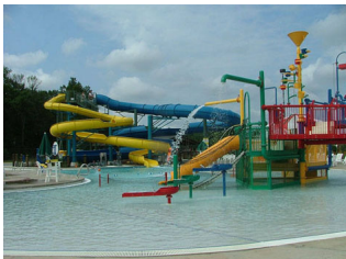
Best Place to Have a Birthday Party

Get ready to hang loose because the coolest place for your kids to be outdoors this summer is splashing around at Breakers Water Park. Home to Arizona's largest wavepool, Breakers offers plenty of water slides for the older kids and water playgrounds for the little tykes. 520.682.2304 , www.breakerswaterpark.com .