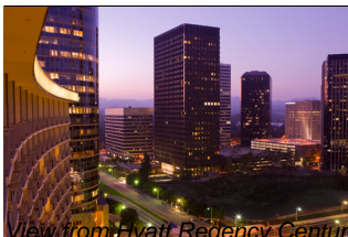
View from Hyatt Regency Century Plaza

In nearby Santa Monica, the world-famous Pier (have a corndog!) is a rewarding visit, and the newly opened 5,000-sq.-ft. Santa Monica Historical Society Museum has historical information on the art, culture and history of the city.