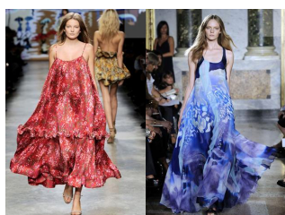
Right: Stella McCartney Left: Emilio Pucci

When it comes to Maxi dresses, length is very important. Most women think that Maxi dresses should reach the heel of the foot, but in reality the ideal Maxi should reach the floor and cover your foot. Now I know you probably hate the idea of your dress dragging on the floor, but I guaranteed that these look the best when worn this way. This also gives the illusion of height to woman who want to appear taller. Maxi dresses are best worn with wedges or flat sandals. The flats bring the dress to a comfortable level, where as the wedges scream fashion and comfort.