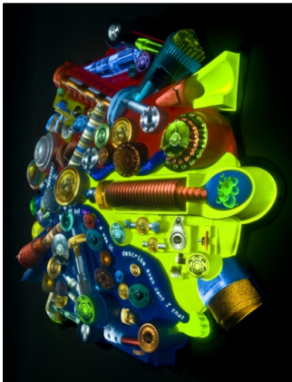
"Peter Sarkisian: Video Works, 1996–2008"

Eating and food are not just a constant in our everyday lives, but also in art. This exhibit, which features 21 local artists, whose artwork was selected by members of the arts community, is bound to please even the pickiest eater. www.herbergertheater.org .