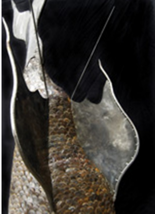
“Lightning in a Bottle”

Following the trail of freedom, Marc has created digital documentary montages of the historic route which include present day photographs with historical materials such as letters, photographs and paintings that will retell the story of the road to freedom. www.phxart.org .