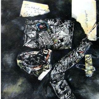
"Chomp: A Show About Comestibles"

In one summer drive, Baumann became inspired by the exotic landscape and ranging colors found in the Southwest. He later mixed vibrant pigments and carefully crafted blocks to bring those landscapes to life on paper for us to enjoy. www.phxart.org .