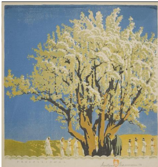
"Gustave Baumann: Artisan Printmaker of the Southwest"

Four Valley artists drew inspiration from one simple, yet important element: water. Through ranging concepts and varying subject matter, guests are invited to experience the ways water is applied and perceived through contemporary art. www.shemerartcenterandmuseum.org .