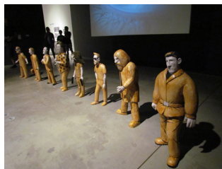
Jon Haddock, Legion , 2011 (installation view); Papier-mache and casein; Approximately 36 x 16 x 12 inches each; Courtesy of the artist Jon Haddock