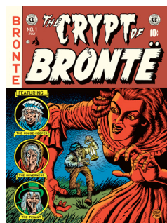
R. Sikoryak, "The Crypt of Bronte" from Masterpiece Comics , 2009. Digital Reproduction. Dimensions variable. Courtesy of the artist. © R. Sikoryak