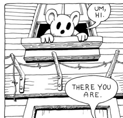
Jon Haddock, Come Down Neville (detail), 2010. Digital image, dimensions variable.