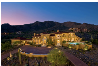
14. Ventana Fine Properties Tenant Improvement, Market Street Commons