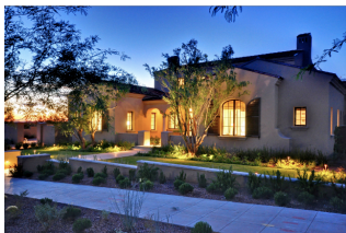
10. Lot 2407, Silverleaf, Custom Home