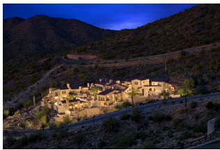
8. Lot 836, Country Club at DC Ranch, 4,100 s.f. Second Floor, Addition to 6,000 s.f. Custom Home