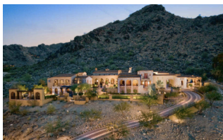
15. Lot 40, Paradise Valley, Custom Home