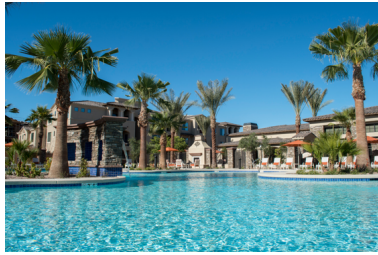
San Milan, Mark-Taylor residential community