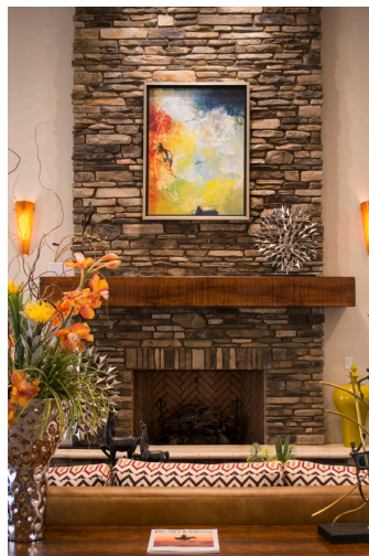
San Milan, Mark-Taylor